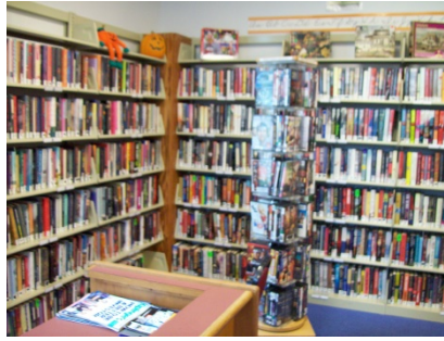
One corner of our bookstore

Yesterday is but today's memory and tomorrow is today's dream. – Kahlil Gibran