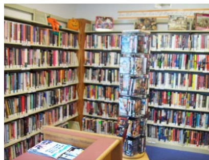
One corner of our bookstore

With many volunteers going on vacation, we are in need of substitutes in the Book Store. This is a great opportunity to meet new people and to be of great service to the library. Please come by the Book Store for an application. We provide training.